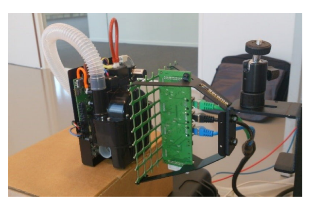
Figure 2. Experimental setup, showing the blower and the acoustic camera.

The transmission of sound through the blower was experimentally investigated. Measurements with an acoustic sound camera, in a broad frequency range and from multiple orientations were conducted. Thereafter, the frequency spectrum was analyzed and the peaks were investigated.