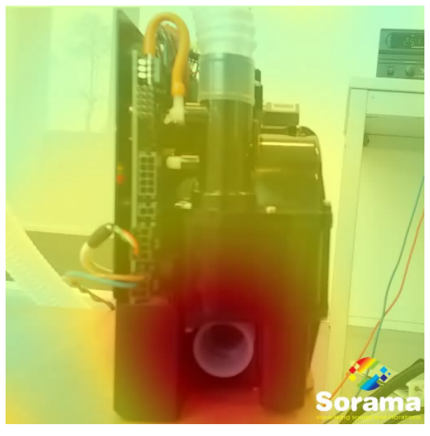
Figure 1. Snapshot from the acoustic sound camera, used to locate problem areas in the blower. The red area has the highest sound intensity.

Medical blowers for respiratory systems must meet strict noise production requirements. One of our clients, a designer of respiratory systems, asked us to localize the source of the noise production. After the identification of the problem areas, design changes could be made to meet the noise production requirements.