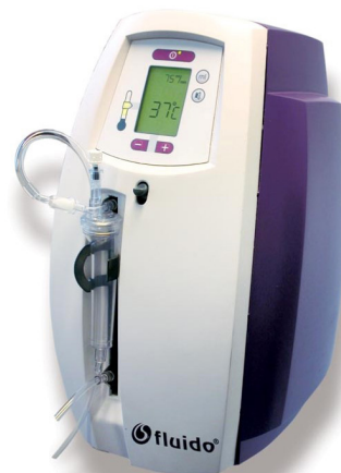
Figure 1 The Fluido device

Demcon advanced mechatronics b.v. and Indes have developed and optimized a new heating principle and temperature control. The device contains a disposable with a liquid which is heated up to body temperature with Infrared Radiation (IR) before it can be injected in the patient's blood circulatory system. The liquid may consists of a saline, but also of a blood-like substance with 60 volume percent red blood cells, referred to as blood plasma.