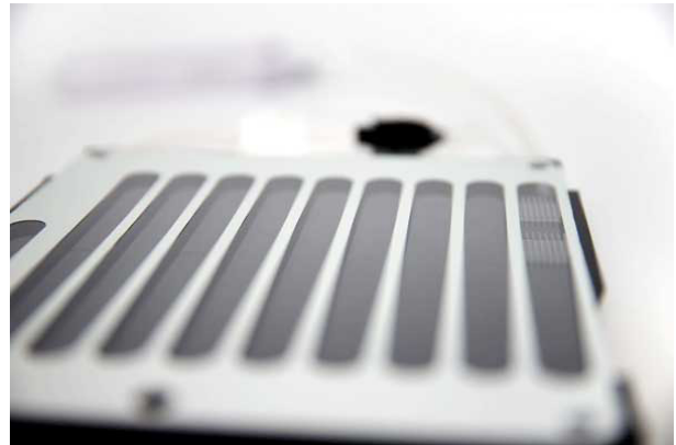
Figure 3 Disposable heat exchanger

Different geometries were investigated. First, the flow turn was optimized such that the recirculation region was resolved. Subsequently, vanes have been added in the flow turn to improve mixing between cold and hot regions. As a criterium for the performance, the flow and temperature variance on the outlet area of the disposable were used. In the final design, the flow and temperature variances were significantly reduced. This is considered to be a major improvement.